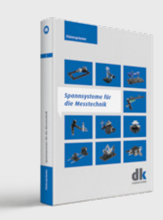
The digital version of our catalogue is available here: www.dk-fixiersysteme.de